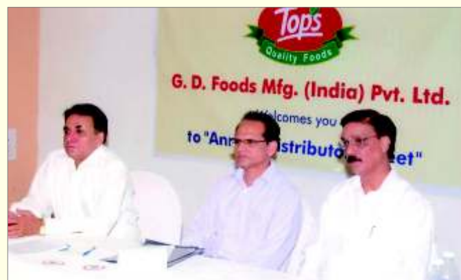
Distributors Meet - U.P. (West) Dehradun