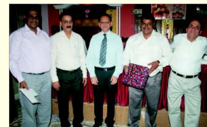
Varanasi S.S. and Dist. with G.D. Foods Team