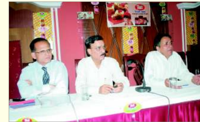
Distributors Meet Varanasi