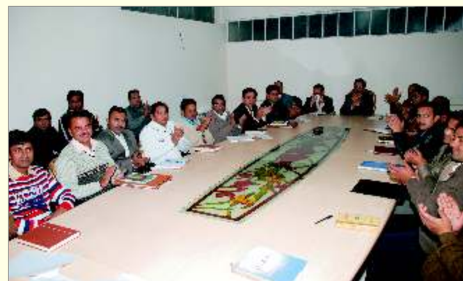
Field force celebrating on higher achievements